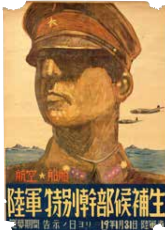
Special Cadet Recruitment Poster

Having prepared for suicide attacks, what did the child soldiers experience in Hiroshima, the city of death? This exhibition explores the mindset of these young soldiers.