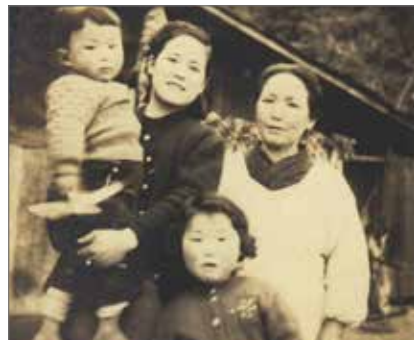
The IMAOKA Family