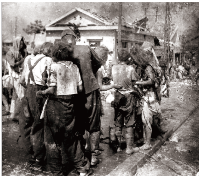
West end of Miyuki-bashi Bridge on August 6, 1945