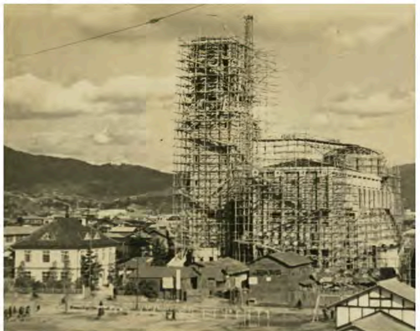
Memorial Cathedral for World Peace, symbol of Hiroshima's reconstruction, being built (circa 1953)